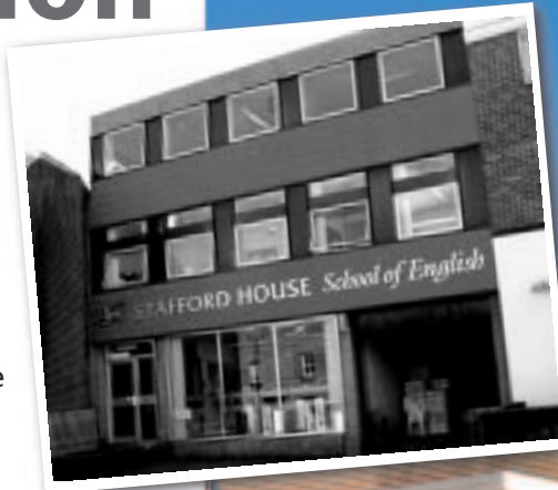
The Stafford House Education Centre in Oaten Hill, Canterbury, shown before refurbishment (inset) and after its recent restoration.

In the last two years more than a million pounds has been invested in expanding education provision at the Stafford House centres. The complete Canterbury campus has now been fully refurbished and equipped with the latest state-of-the-art equipment and a large majority of the classrooms also boast a sophisticated audio-visual and IT technology.